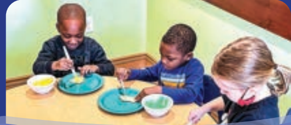
Culinary artists. Photo Gallery, pages 6 & 7

People of all ages & abilities spend their day at St. Ann Center, thanks to your support. Here's your window into our joyful intergenerational community.