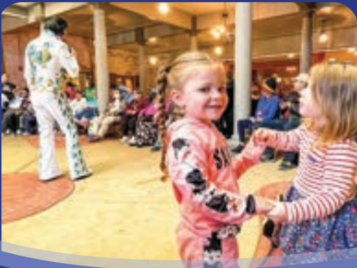
The Strictly Elvis Show rocked the Stein!