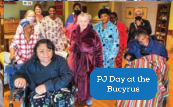
PJ Day at the Bucyrus