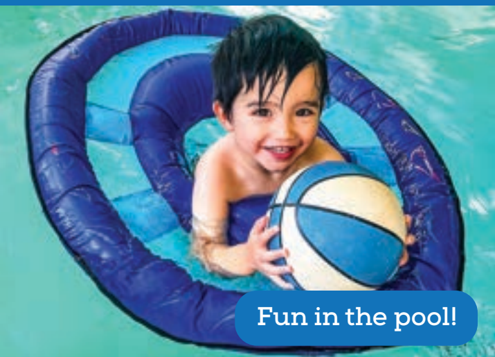
Fun in the pool!