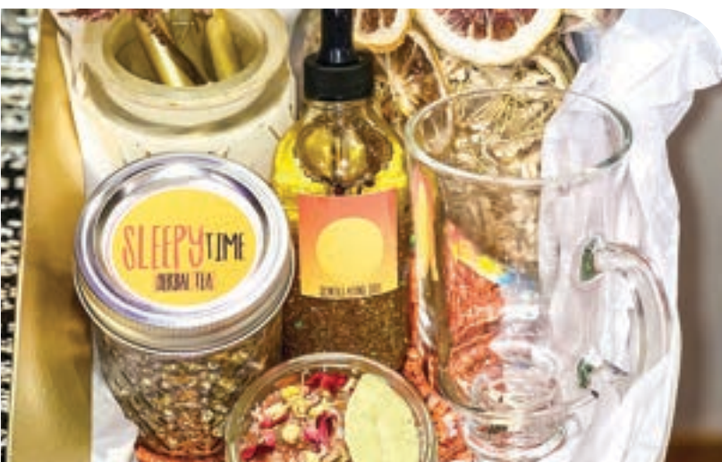
Herbal teas and more await!

Prices range from $5 to $65, and she always offers a sample of her "Tea of the Day" to enjoy in the store, with a cookie. You can also purchase a cup of tea to go, or buy the blend to make at home yourself.