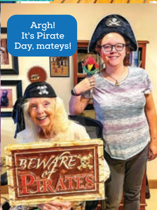
Argh! It's Pirate Day, mateys!