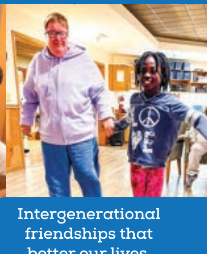
Intergenerational friendships that better our lives.