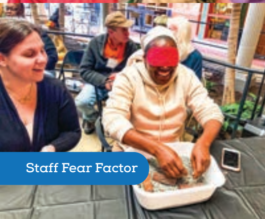
Staff Fear Factor