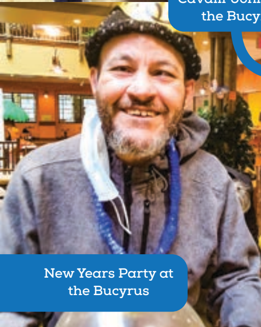
New Years Party at the Bucyrus