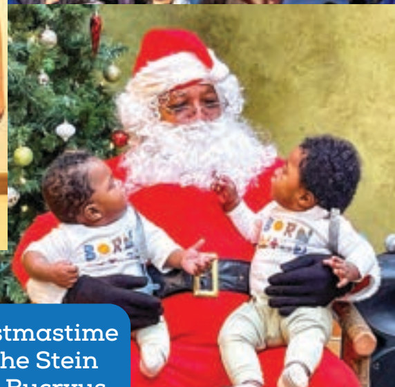
Christmastime at the Stein and Bucryus