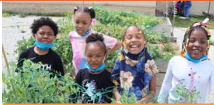
Check out these shots taken this past year around the vibrant Bucyrus Campus. What a change from desolate brownfield of 10 years ago (below)!

array of services addressing neighborhood residents' social, educational, health and employment needs.