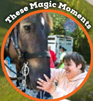
These Magic Moments