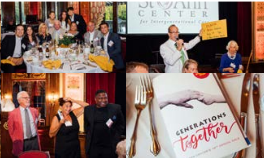
Our 2022 Generations Together Gala fundraiser brought about 300 of our good friends to The Wisconsin Club for an elegant and laughter-filled evening of auctions, music, photos, and stories.. Doesn't everybody look great?