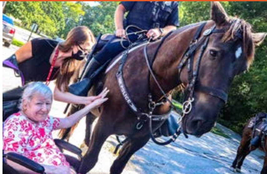
Horses from the MPD Mounted Patrol Unit visited the Stein Campus, thrilling the clients and children who went nose to nose with them.