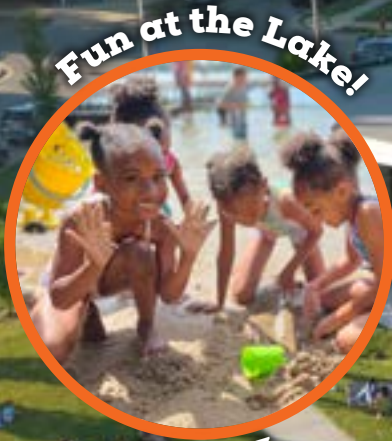
Fun at the Lake!

People of all ages and abilities spend the day at St. Ann Center because of your support. You made these stories of our joyful intergenerational community possible.