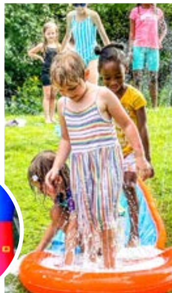
Games and fun from the Summer Carnival.