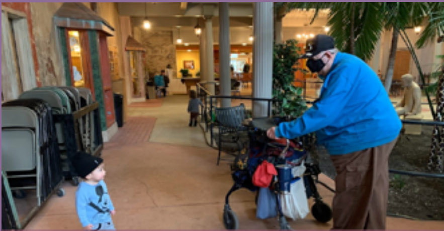
Taking a breather from an impromptu game of tag in the Stein atrium.