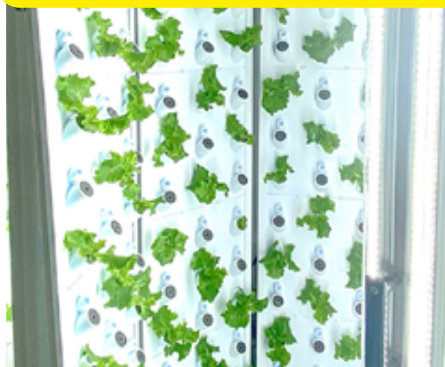
Seeds are started in a separate unit, then get transplanted into root chambers.