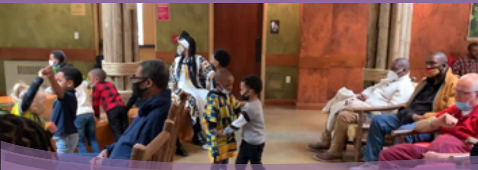
Bucyrus adults and children celebrate Black History Month with an intergenerational dance.