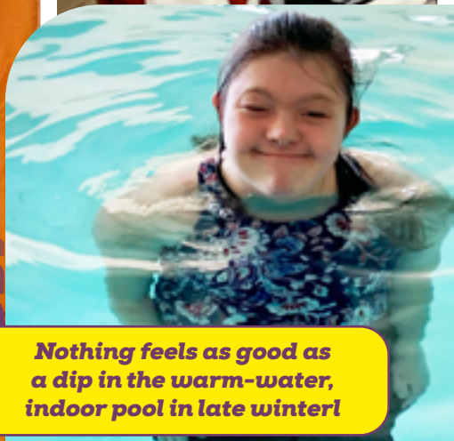
Nothing feels as good as a dip in the warm-water, indoor pool in late winter!