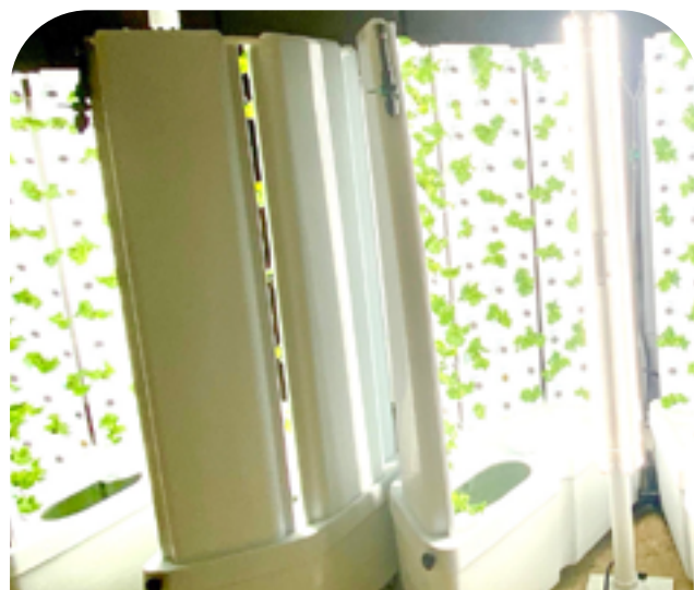
The grow walls close around the LED light tower.

The Green Corridor is an interior hallway with windows looking out over the playgarden outside to the east. Windows along the hall's other side look into the art room. Both children and adult clients will have plenty of opportunities to see where some of the fresh food for their lunches is grown... and to remind them of the daily miracle involved in food production.