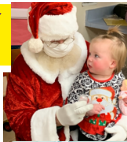
Tiny tots, with their eyes all a-glow, shared holiday wishes with Santa.