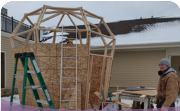
A whimsical Teapot House is part of the Intergenerational Play Garden Don Patzke's building at the Bucyrus Campus.

Contact Gloria with additional questions at (414) 210-2428.