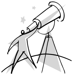
Caption describing picture or graphic.

The most important information is included here on the inside panels. Use these panels to introduce your organization and describe specific products or services. This text should be brief and should entice the reader to want