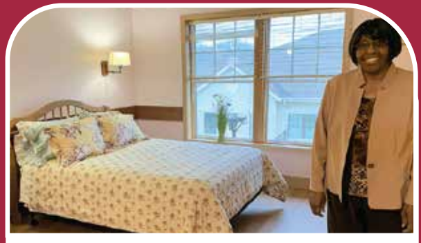
An Overnight Respite Care Unit opens at the Bucyrus Campus, with nine bed-and-breakfast-style guest rooms, a whirlpool tub room, dining room, great room and game nook.