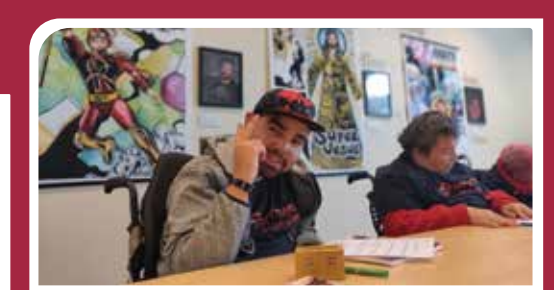
"The Adventures of the Righteous League," a superhero saga created by Stein Campus clients during Timeslips storytelling sessions, is published as a book--complete with original comic book illustrations.