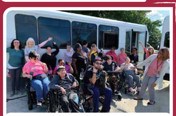
An accessible bus is donated by the REV Group, enabling clients who use wheelchairs to go on outings.