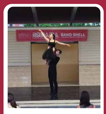
Entertainment begins on the stage of the new Indaba Band Shell, including performances by local gospel choirs, the Florentine Opera Company and the Milwaukee Ballet.